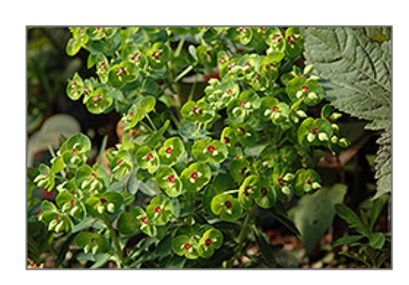
Rudolph Spurge flowers

Mounded perennial has beautiful glaucous sea green foliage, contrasting nicely with yellow and chartreuse flowers with red blotches, some red fall color; adapts to varied soils, deer tend to stay away; milky sap can be a skin irritant to humans