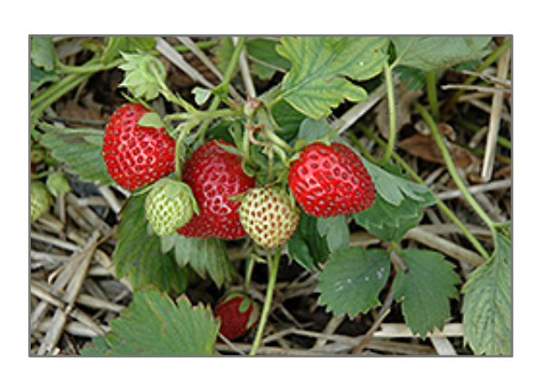
June-Bearing Strawberry fruit

Extremely hardy plant with soft red flavorful fruit is vigorous and productive; watch for the runners that spread; fruit freezes well; drought tolerant, can plant in hanging baskets and containers too