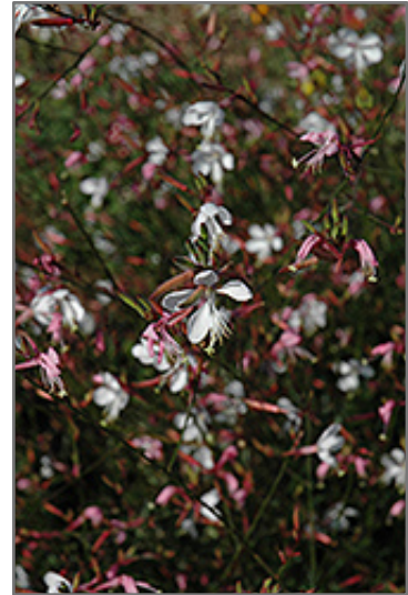
Snowstorm Gaura flowers

This is a relatively low maintenance plant, and is best cleaned up in early spring before it resumes active growth for the season. It is a good choice for attracting butterflies to your yard, but is not particularly attractive to deer who tend to leave it alone in favor of tastier treats. It has no significant negative characteristics.