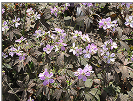
Espresso Cranesbill flowers