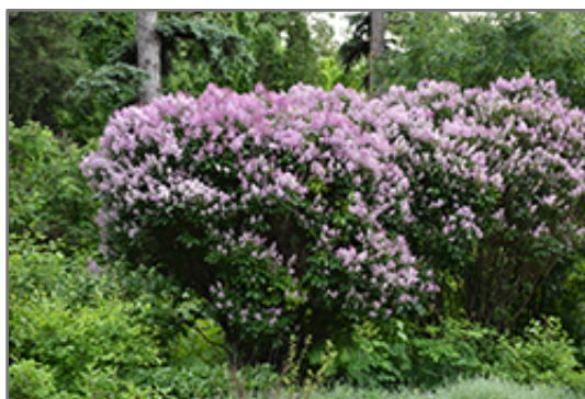
Donald Wyman Lilac in bloom