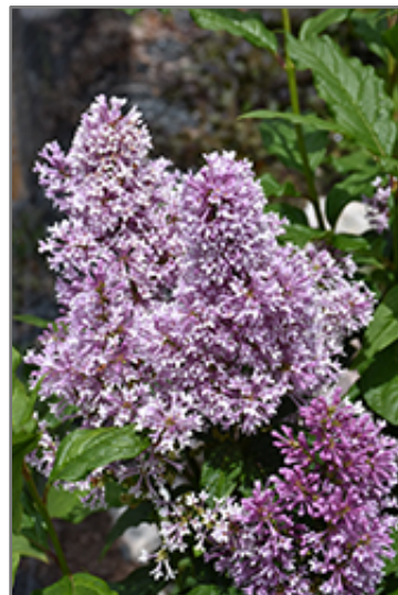
Donald Wyman Lilac flowers

Donald Wyman Lilac is recommended for the following landscape applications;