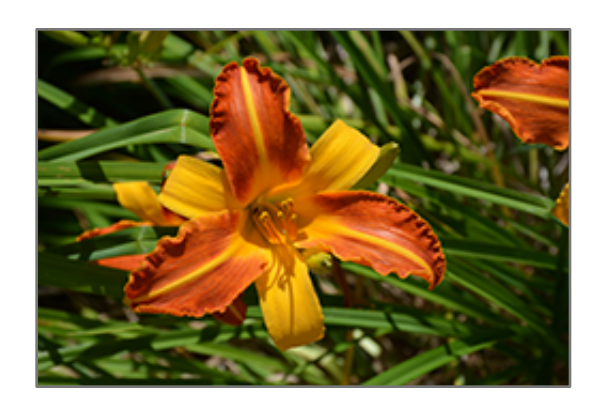
Frans Hals Daylily flowers

Outstanding, super-bright, large, bicolor trumpets alternating in red-orange and gold; sturdy, strong, easy to care for, great grassy texture and form; good for the beginner gardener and the pro