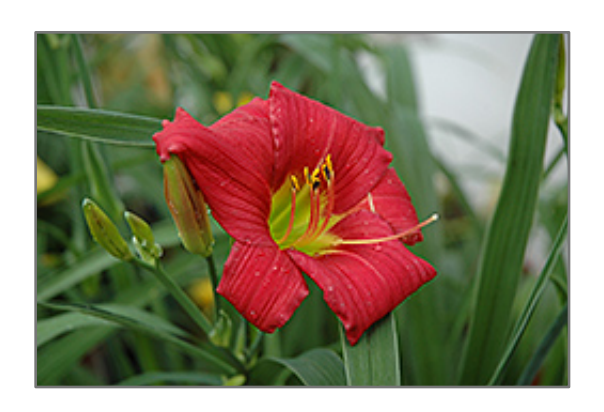
Little Business Daylily flowers

This is a relatively low maintenance plant, and is best cleaned up in early spring before it resumes active growth for the season. It is a good choice for attracting butterflies to your yard. It has no significant negative characteristics.