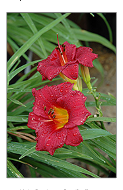
Little Business Daylily flowers

Little Business Daylily is recommended for the following landscape applications;