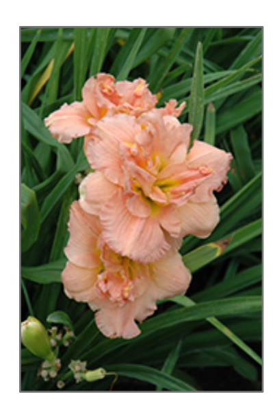
Siloam Double Classic Daylily flowers