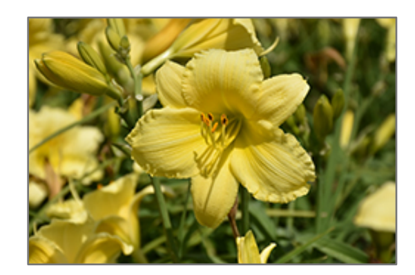
Stella Supreme Daylily flowers

Reblooming pale-yellow trumpet with yellow halo and green throat; sturdy, strong, easy to care for, great grassy texture and form; good for the beginner gardener and the pro