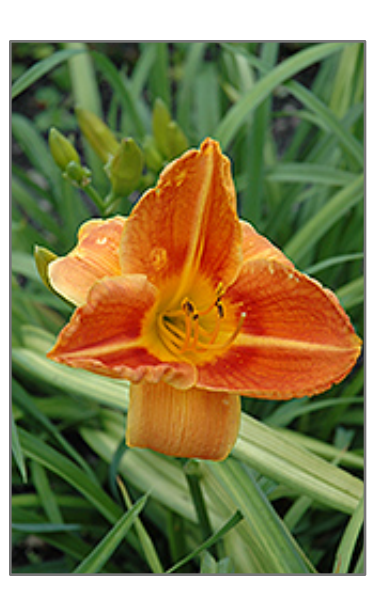
Tuscawilla Tigress Daylily flowers

Bold, reblooming, orange trumpets with gold midribs and center; sturdy, strong, easy to care for, great grassy texture and form; good for the beginner gardener and the pro