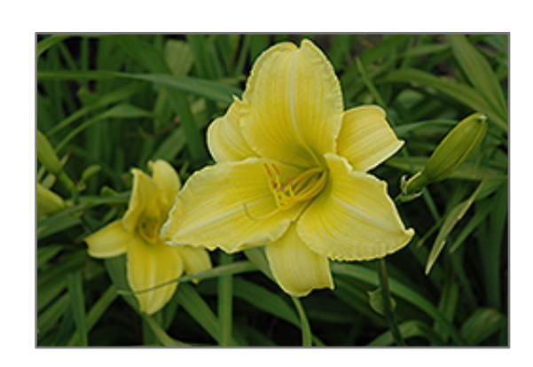
Eenie Weenie Daylily flowers

Exceptional dwarf variety with pleasant yellow blooms in summer; compact habit with a great grassy texture and form, versatile and easy to grow; ideal for edging in the garden border