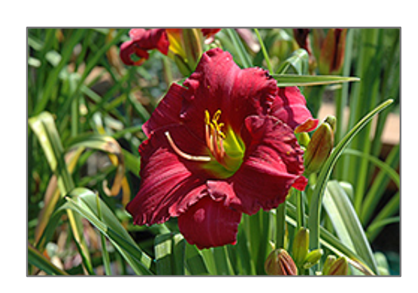
Woodside Ruby Daylily flowers

Bright, large, ruby-red trumpets with yellow-green throat and ruffled edges; sturdy, strong, easy to care for, great grassy texture and form; good for the beginner gardener and the pro