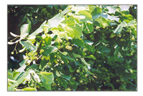
Littleleaf Linden flowers