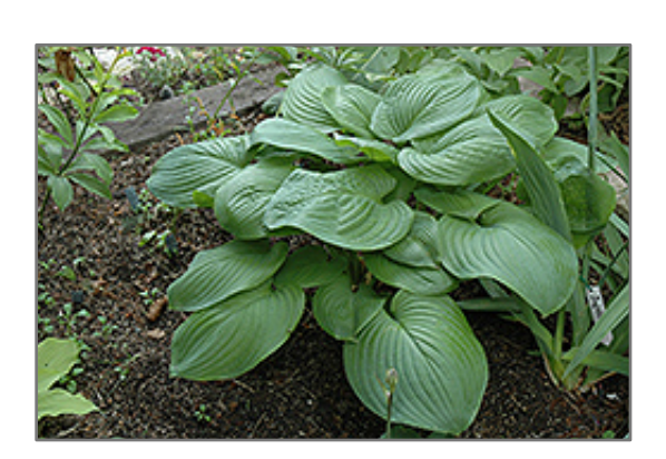
Fried Green Tomatoes Hosta

Large, rounded, rich dark green leaves, reminiscent of green tomatoes; fragrant white flowers are great for attracting hummingbirds; provided beautiful texture and contrast to other plants; tolerates heat well without scorching