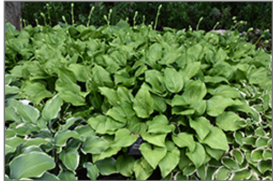
Royal Standard Hosta

Royal Standard Hosta is recommended for the following landscape applications;