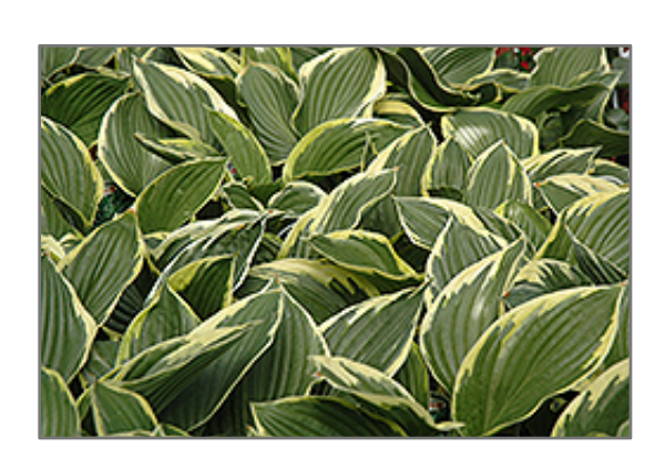
Golden Variegated Hosta foliage

Attractive olive green leaves with gold variegation; provides beautiful texture and contrast to other plants; lavender spikes of flowers in mid to late summer