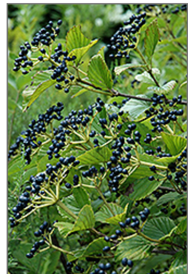
Arrowwood fruit