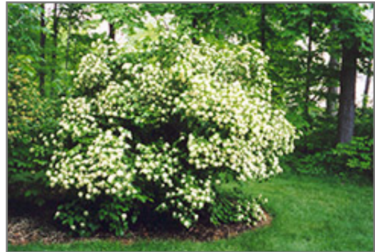
Arrowwood in bloom

This shrub does best in full sun to partial shade. It prefers to grow in average to moist conditions, and shouldn't be allowed to dry out. It is not particular as to soil type or pH. It is highly tolerant of urban pollution and will even thrive in inner city environments. This species is native to parts of North America.