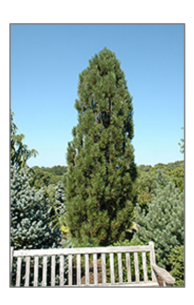
Arnold Sentinel Austrian Pine