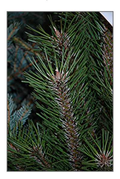
Arnold Sentinel Austrian Pine foliage