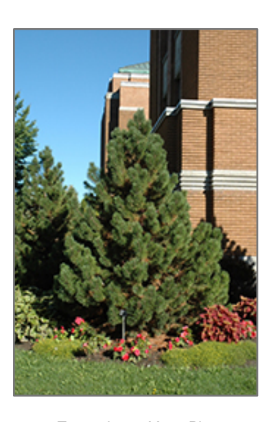
Tannenbaum Mugo Pine