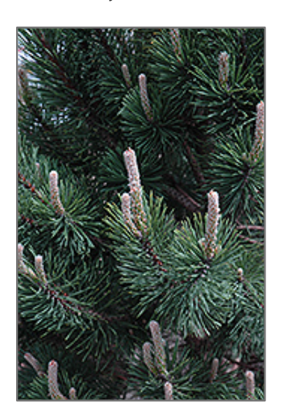
Tannenbaum Mugo Pine foliage