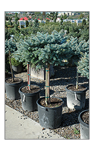
Globe Blue Spruce (tree form)