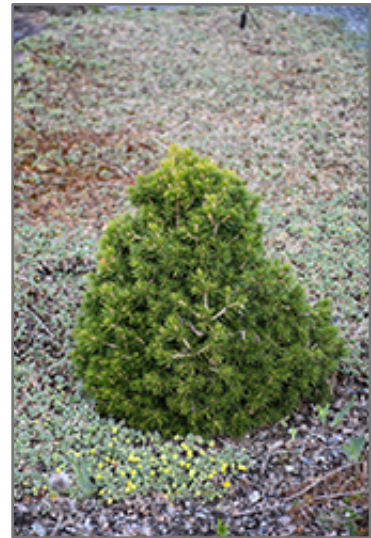
Tompa Dwarf Spruce