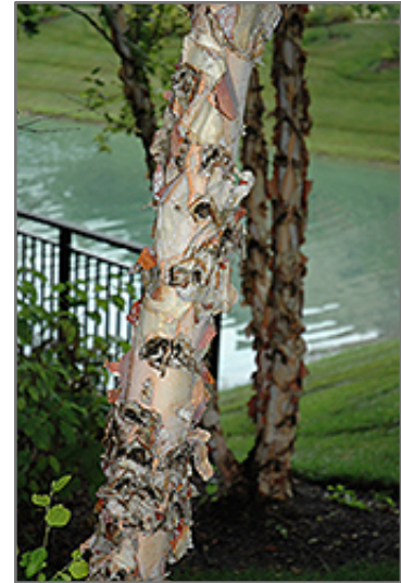
River Birch bark