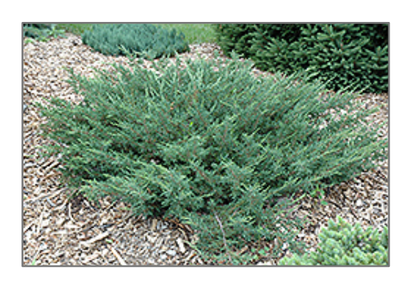
Alpine Carpet Juniper

A dense and proliforous groundcover that is sure to add interest, low spreading habit and beautiful blue-green foliage is sure to attract attention; very hardy and disease resistant, it is also slow growing and is very low maintenance