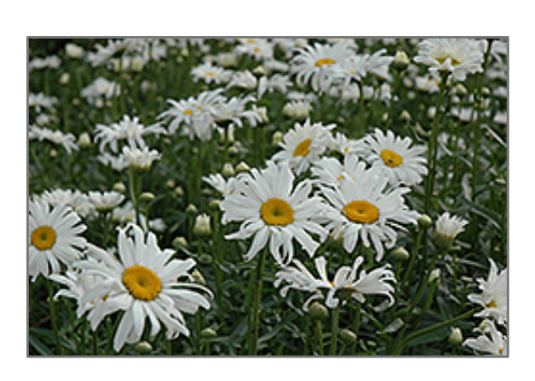
Shasta Daisy flowers

The ever popular shasta daisy is a robust perennial which blooms over a long period with happy bright flower heads borne singly on long stems for a tremendous contrast with the dark green foliage; beautiful massed along borders