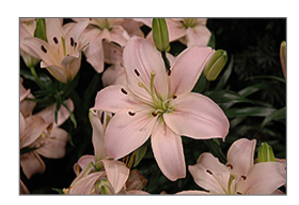
Lily Looks Tiny Athlete Lily flowers