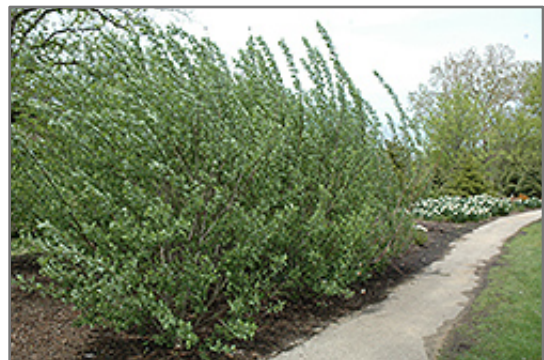
French Pussy Willow