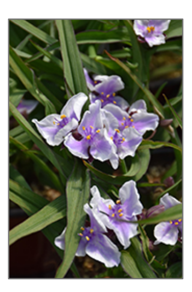
Bilberry Ice Spiderwort flowers

Bilberry Ice Spiderwort has masses of beautiful clusters of white flowers with lavender overtones at the ends of the stems from early to late summer, which emerge from distinctive purple flower buds, and which are most effective when planted in groupings. Its grassy leaves remain green in colour throughout the season.