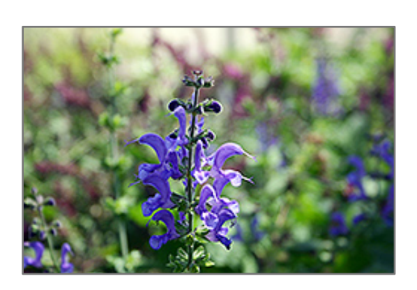
Rhapsody In Blue Meadow Sage flowers

An excellent rebloomer with flowers in shades of rich purple and blue held over fragrant deep green foliage, allowing for a reliable show of floral color from spring to fall; excellent plant for summer containers