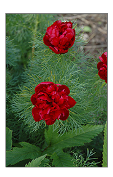
Double Fernleaf Peony flowers