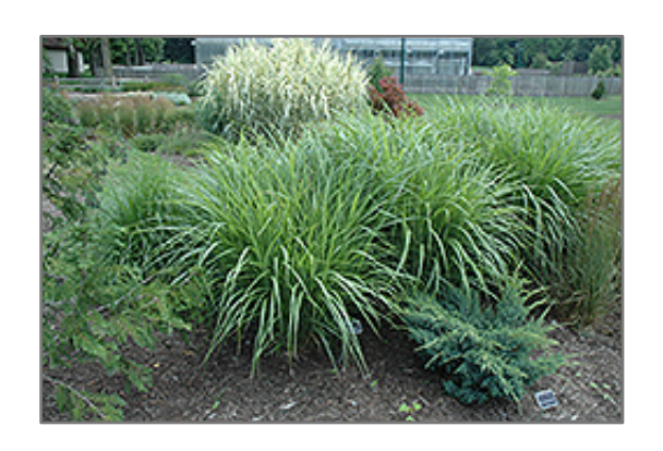
Silberfeder Maiden Grass

Silberfeder Maiden Grass features dainty plumes of coral-pink flowers rising above the foliage in late summer. The silver seed heads are carried on showy plumes displayed in abundance from early fall to late winter. Its grassy leaves are dark green in colour. The foliage often turns yellow in fall. The tan stems can be quite attractive.