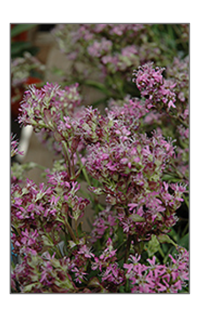
Arctic Campion flowers

Native to the Arctic regions of North America and Europe, this small grassy-like tufted-mound perennial produces sweet little ball-like clusters of rosy-pink blooms; the miniature form makes this plant a spectacular addition for any rock or scree garden