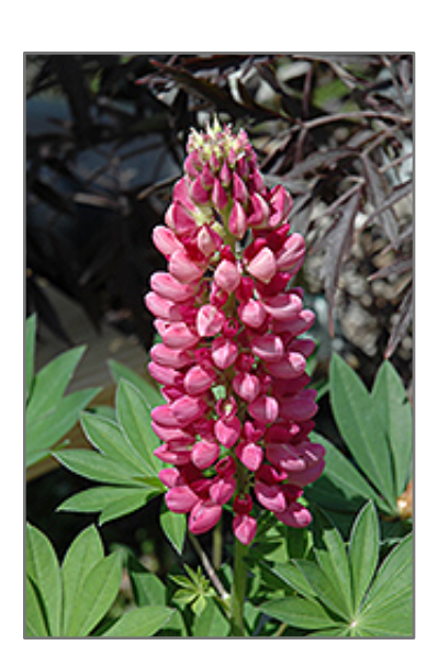
Gallery Red Lupine flowers

Gallery lupines are shorter than other varieties but the larger flower spikes make up for it; this selection has solid red flowers, deadheading can promote reblooming; prefers cooler climates and a well-drained, organic rich soil