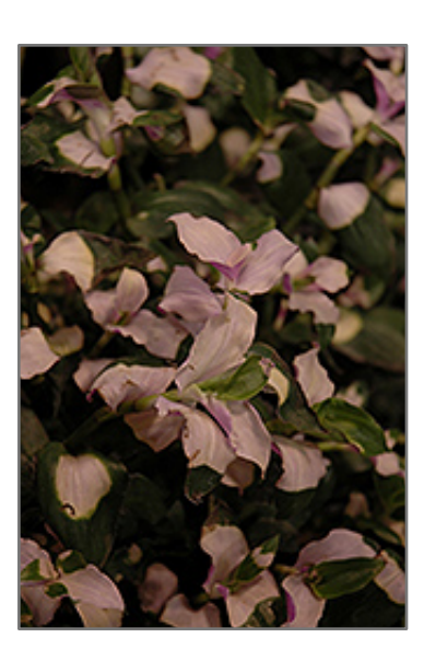
Blushing Bride Spiderwort foliage

Blushing Bride Spiderwort has masses of beautiful clusters of hot pink flowers with a white flare at the ends of the stems from early to late summer, which are most effective when planted in groupings. Its attractive pointy leaves emerge shell pink in spring, turning green in colour with curious pink undersides and tinges of shell pink throughout the season.