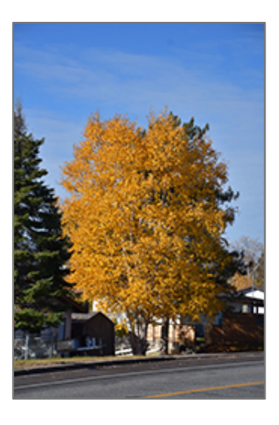
Clump Paper Birch in fall