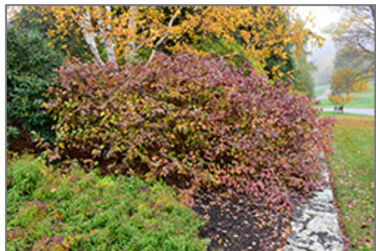
Bailey Red-Twig Dogwood in fall