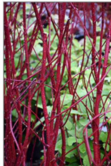
Bailey Red-Twig Dogwood stems

Bailey Red-Twig Dogwood is recommended for the following landscape applications;