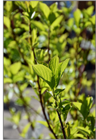
Bailey Red-Twig Dogwood foliage

This shrub does best in full sun to partial shade. It is an amazingly adaptable plant, tolerating both dry conditions and even some standing water. It is not particular as to soil type or pH. It is highly tolerant of urban pollution and will even thrive in inner city environments. This species is native to parts of North America.