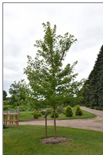
Matador Maple