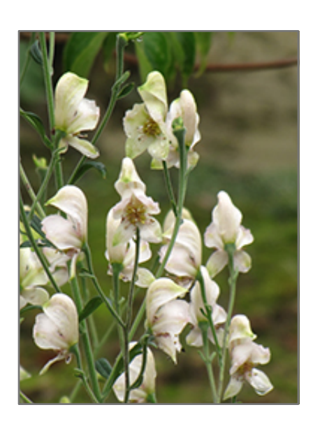
Common White Monkshood flowers