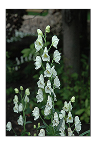
Common White Monkshood flowers