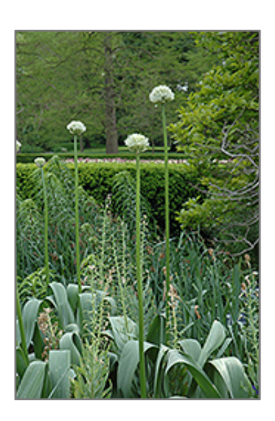
White Giant Ornamental Onion flowers