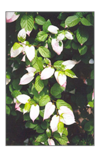
Arctic Beauty Kiwi foliage