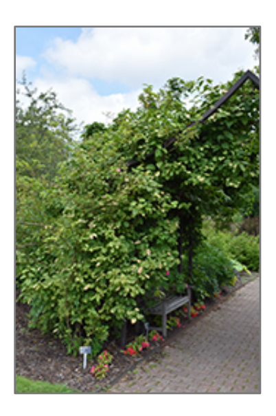
Arctic Beauty Kiwi