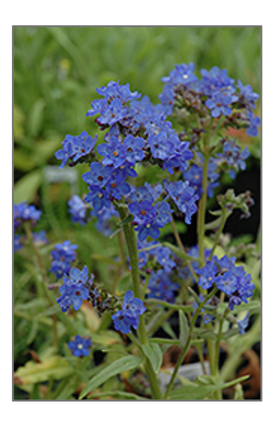
Blue Angel Summer Forget-Me-Not flowers