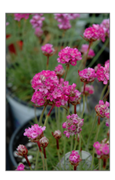
Splendens Sea Thrift flowers

This compact plant is great in rock and alpine gardens; pretty rose-red clusters of flowers rise above glossy, grassy foliage forming a neat clump; will tolerate areas affected by salt and heat