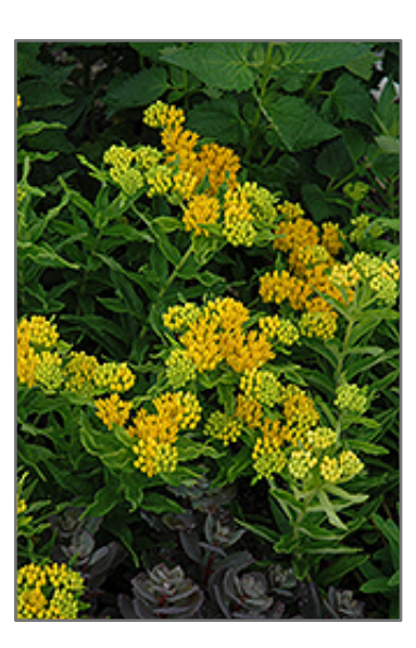
Hello Yellow Milkweed flowers

Milkweed is the most important plant to the monarch butterfly caterpillar; this variety features vibrant yellow flowers; great for dry, sunny areas; can use dried seed pods for crafts