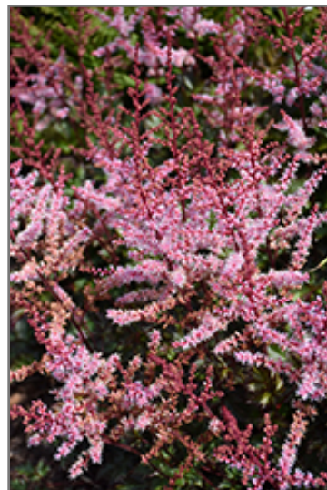
Delft Lace Astilbe flowers

This is a relatively low maintenance plant, and is best cleaned up in early spring before it resumes active growth for the season. It is a good choice for attracting butterflies to your yard, but is not particularly attractive to deer who tend to leave it alone in favor of tastier treats. It has no significant negative characteristics.