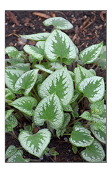
Emerald Mist Bugloss foliage