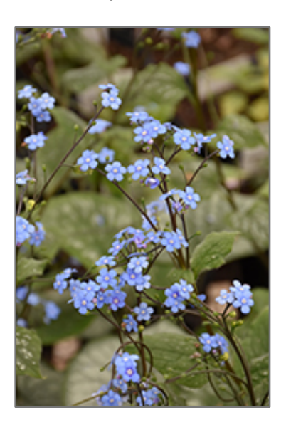
Emerald Mist Bugloss flowers