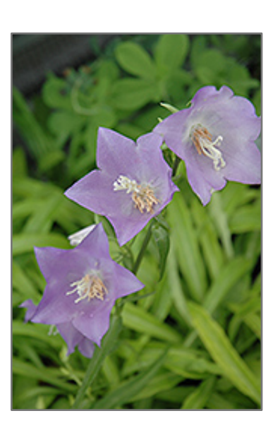
Blue Eyed Blonde Peachleaf Bellflower flowers

Blue Eyed Blonde Peachleaf Bellflower features showy spikes of blue bell-shaped flowers rising above the foliage from early to late summer. The flowers are excellent for cutting. Its attractive narrow leaves remain gold in colour throughout the season.