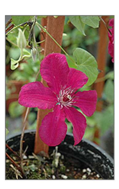
Kardinal Wyszynski Clematis flowers

Kardinal Wyszynski Clematis features showy red star-shaped flowers at the ends of the branches from mid to late summer. It has green deciduous foliage. The compound leaves do not develop any appreciable fall colour.