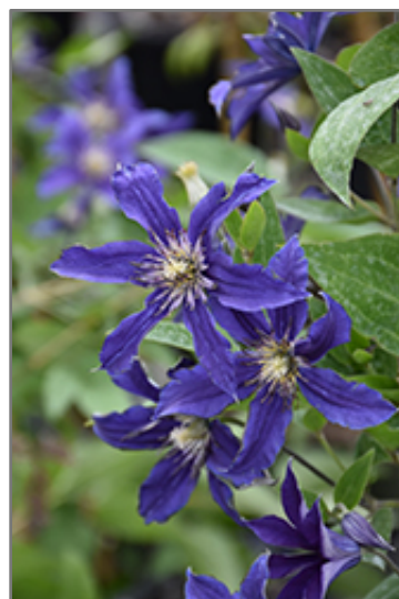
Sapphire Indigo Clematis flowers