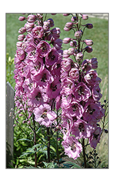
Dusky Maidens Larkspur flowers

Magnificent display of lilac-pink flowers with dark bee, on towering spikes with good vertical form, dense flower spikes and strong stems; excellent uniformity