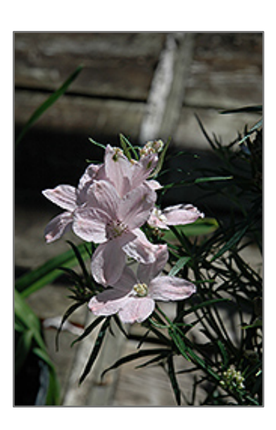
Summer Morning Dwarf Larkspur flowers

Summer Morning Dwarf Larkspur features bold panicles of shell pink flowers at the ends of the stems from early to mid summer. The flowers are excellent for cutting. Its deeply cut ferny leaves remain dark green in colour throughout the season.