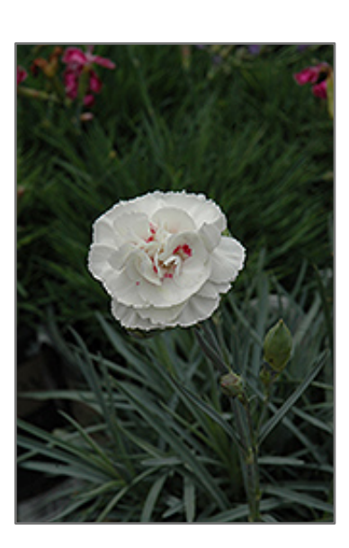
Fancy Knickers Pinks flowers

Pretty double white flowers look like miniature carnations; rising above mounds of fine foliage; great for flower arrangements; deadhead to rebloom; pair up with summer blooming perennials and annuals to time a continued flower display